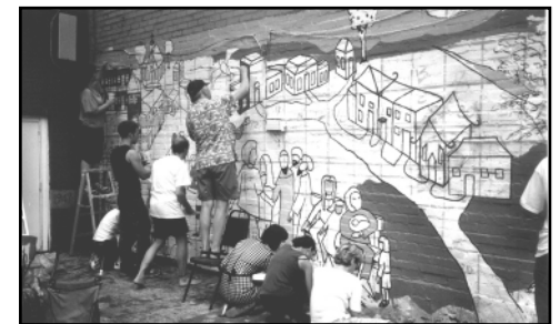
Création de la nouvelle murale durant le festival de paix.

Hocine Tahmi est un de nos bénévoles qui contribue aux activités depuis plus de deux ans.