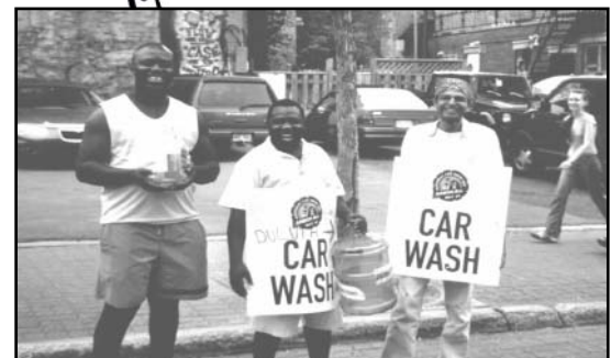
Volunteers from Project Refuge are all smiles after a day of washing cars at MA.

MA has held three successful car washes this summer raising upwards of $1500 to help subsidize outings to OKA beach, Mont Tremblant and Camp Penial for former Project Family residents. Thank you to all of the staff and volunteers who helped out!