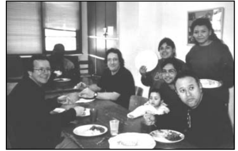
Staff, residents and volunteers dig into an incredible curry prepared by a resident from Family Refuge.

These meals are more significant than simple nourishment-they are, in a way, a metaphor for how MA functions. Shared meals offer a time when individuals can sit as equals around a table. They break down boundaries of power imbalance, cultural difference and fear,