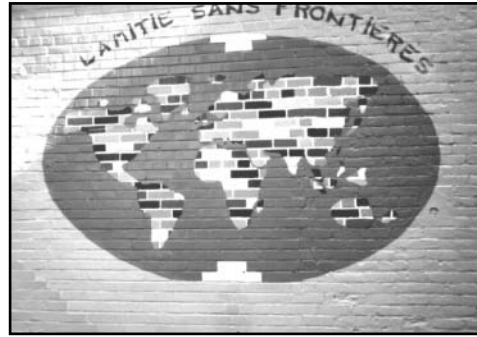
Murale "L'amitié sans frontière"